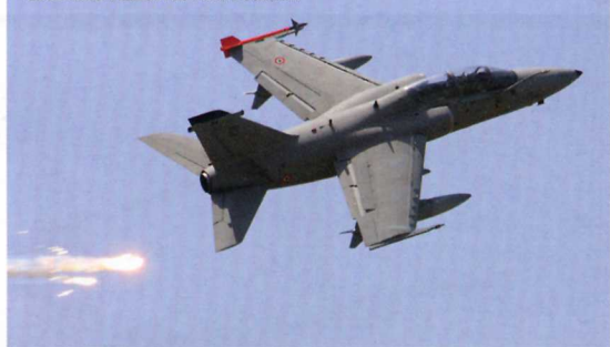
A flare-firing AMX during the Italian AF set-piece at the Giornata Azzurra.

Proof that Pratica really does make perfect!